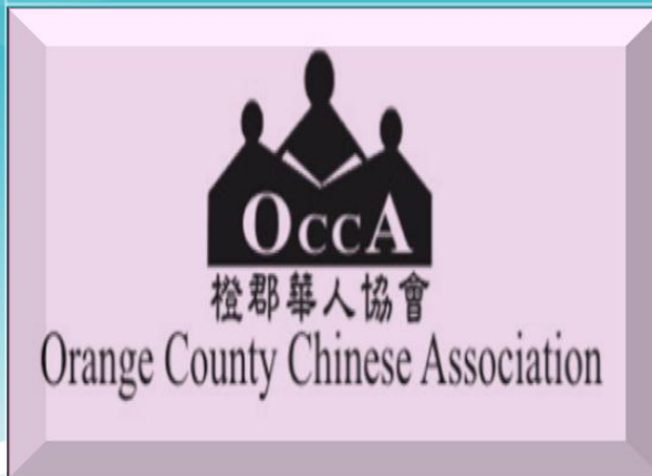
OCCA Newsletter Issue 5, August 25 2013